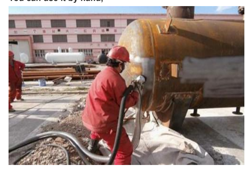
or mounted on blasting gun rack like this